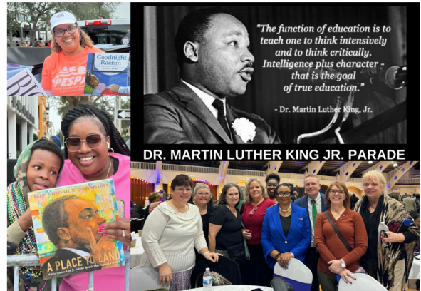
DR. MARTIN LUTHER KING JR. PARADE

During the event 30 volunteers walked the Dream Big Parade route handing out 1,500 free books, journals, and pencils to parade goes along the parade route in downtown St. Petersburg, Florida.