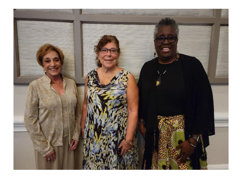
Human and Civil Rights Dinner The dinner was a beautiful, formal evening honoring winners of HCR Awards.